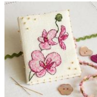
Plum Orchid Needlebook