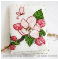
Apple Blossom Needlebook