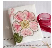
Wild Rose Needlebook

These designs, and many more, are available on